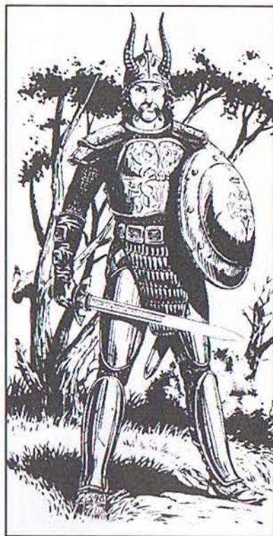
By Larry Elmore, from "Dragons of Mystery"

Chainmail armor; Two Handed sword +3 (damage 1-10); No ranged weapon.