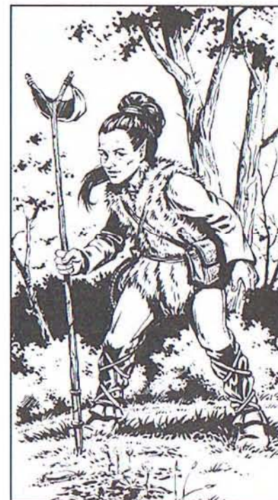
By Larry Elmore, from "Dragons of Mystery"

Leather armor; Hoopak +2 (damage 3-8); Sling +1 with a pouch of 20 bullets (damage 2-7).