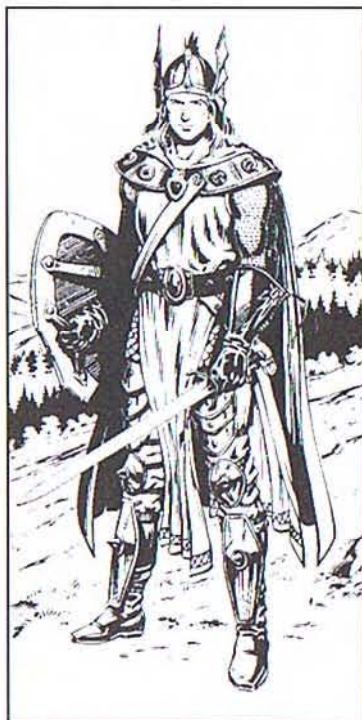
By Larry Elmore, from "Dragons of Mystery"

Ring mail armor; Longsword (damage 1-8); Spear (damage 1-6).