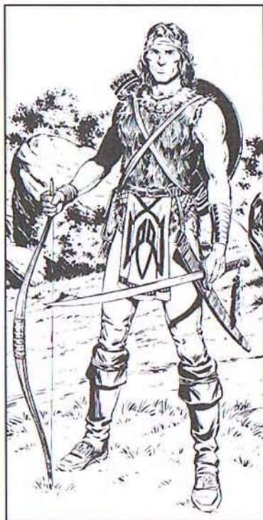
By Larry Elmore, from "Dragons of Mystery"

Leather armor & Shield; Longsword +2 (damage 1-8); Bow & quiver of 20 arrows (damage 1-6).