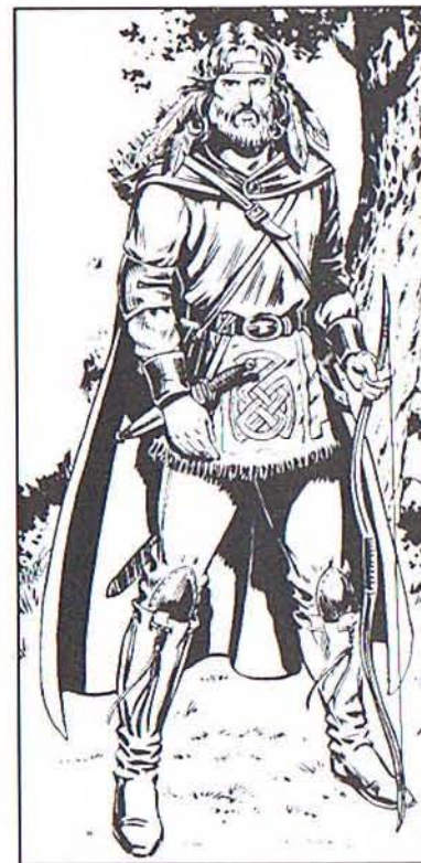
By Larry Elmore, from "Dragons of Mystery"

Leather armor +2; Longsword +2 (damage 1-8); Bow & quiver of 20 arrows (damage 1-6).