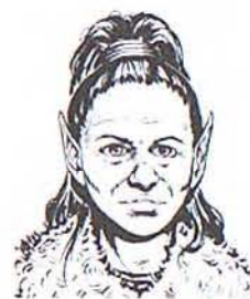
By Larry Elmore, from "Dragons of Hope"

Most people not only don't understand Kender but don't want to know them. This is often due to their basic personality traits: fearlessness, unbelievable curiosity, irresistible mobility, independence and the need to pick up anything not screwed down (unless they have a screwdriver, in which case...)