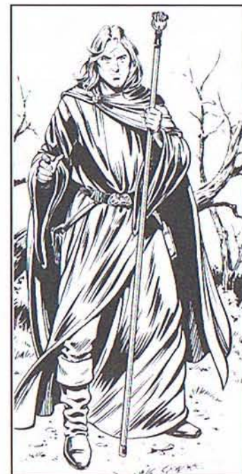
By Larry Elmore, from "Dragons of Mystery"

Staff of the Magius (+3 protection; +2 to hit - damage 1-8); Close combat with Staff as weapon; Ranged combat - see spell list.