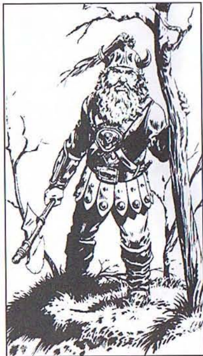
By Larry Elmore, from "Dragons of Mystery"

Studded Leather armor & Shield; Battleaxe +1 (damage 1-8); Throwing axes (damage 1-6).