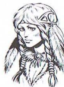
from "Dragons of Hope"

Daughter of the chieftain of the Que-Shu tribe, Goldmoon's future seemed to be set from birth; whomever she married would become chief of the Que-Shu. Unknown to everyone, the gods had different plans for her. The first sign of these plans came when Goldmoon fell in love with Riverwind rather than any of the other more suitable young men.